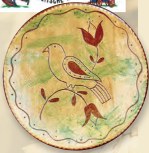
The redware charger shown here was produced during an HSI Workshop.